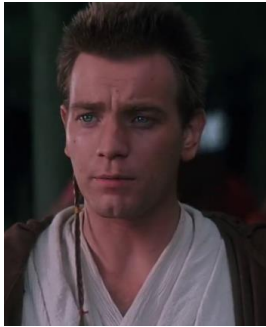
Padawan apprentice with a braid.

Re-read this brief conversation between August and Julian. The pictures below show the different Star Wars characters they are speaking about.