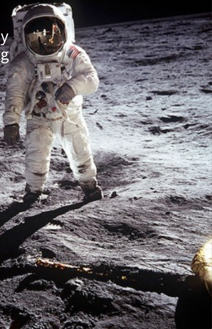
Photo of Buzz Aldrin on the moon, taken by Neil Armstrong

that man's first steps on moon could be seen by the rest of the world. As Armstrong took his first steps on the moon he said the now famous words: "That's one small step for man, one giant leap for mankind."