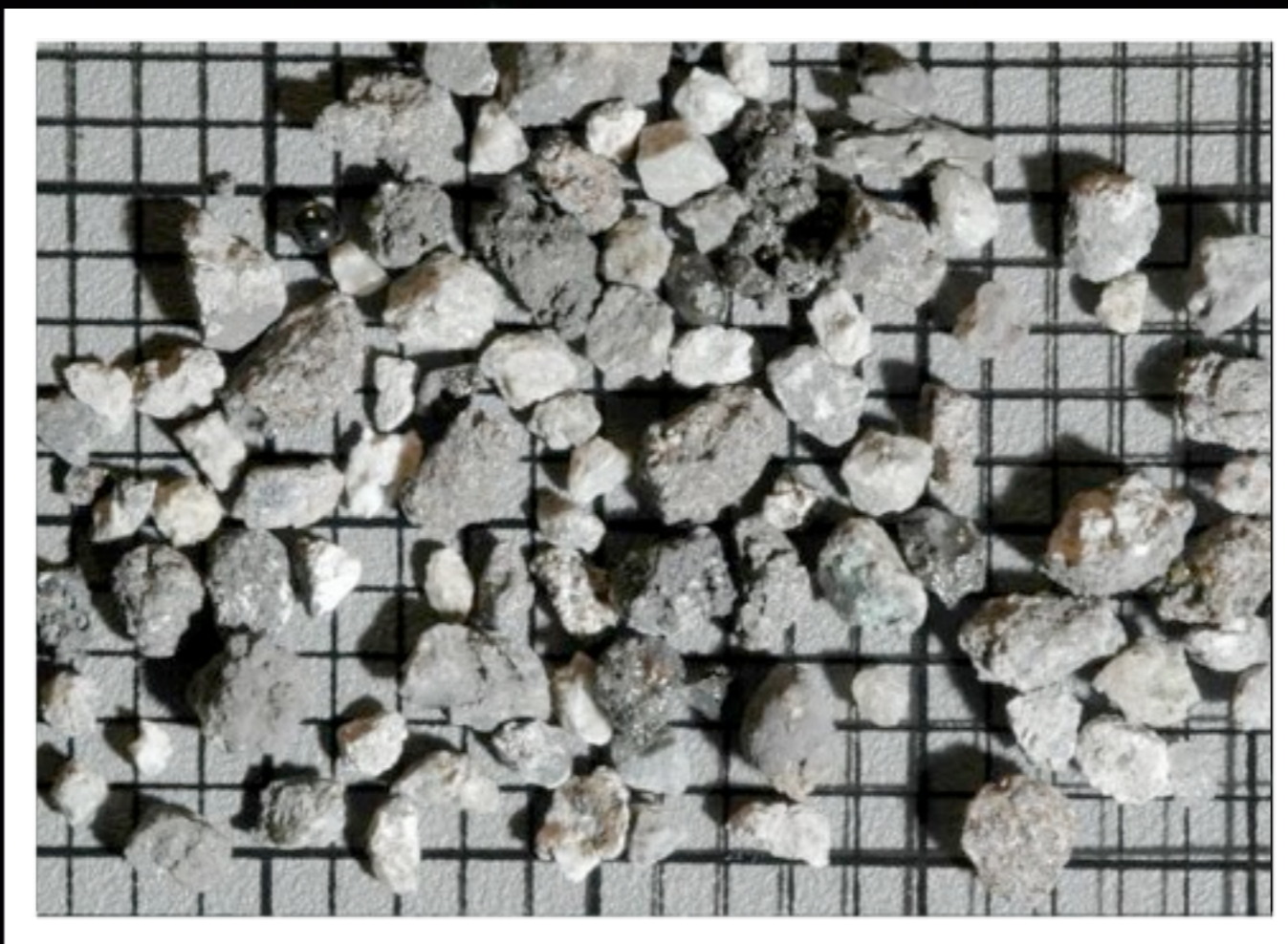
Moon rock samples collected by Apollo 11

While they were on the moon, the astronauts had to collect lots of samples to take back to Earth and complete lots of experiments so that data and information about the moon could be examined more closely. Altogether they spent 21 hours on the moon before heading back to Earth and had 22kg of rock and sand samples with them on their return.